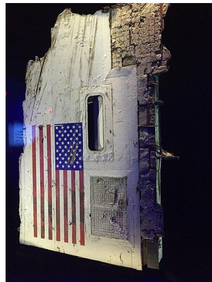
Fragment of Challenger's fuselage on display at Kennedy Space Center

set of practices that lacked congruency with their practice. The flight had tremendous social pressure to launch because the first American civilian, a teacher, was on board to participate in the Teacher in Space project. In 1984, President Ronald Reagan launched this program to inspire and honor teachers and spur interest in mathematics, science, and space exploration. This background played a role in creating the circumstance that led to the lack of congruency between the espoused norms and norms in use.