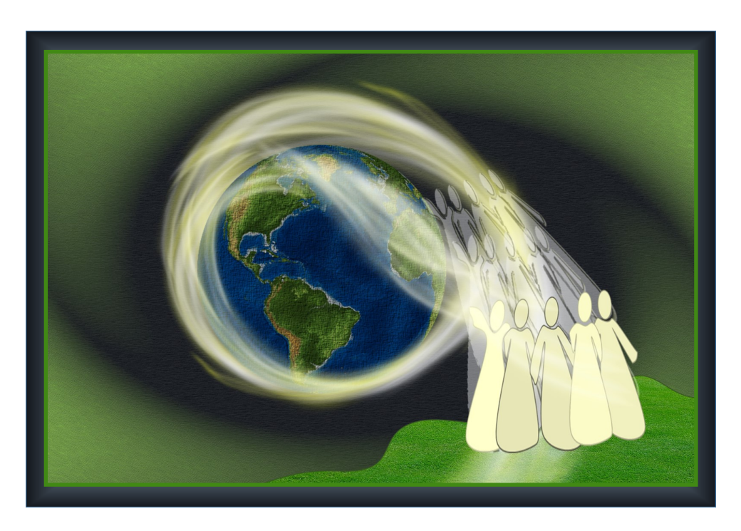
Transformative Communities Integrating Culture, Collaboration and Community